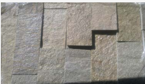
2.1 grey-gold ( beige)