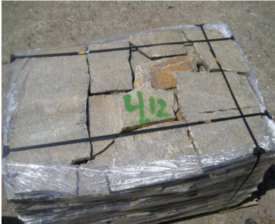
1.3 grey-gold (beige)